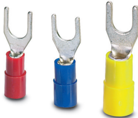
Figure may contain other products.